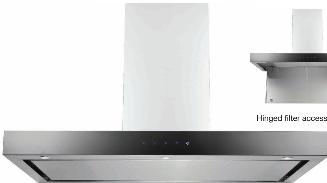
Hinged filter access panel