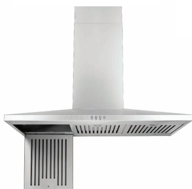
Filter hinge safety system