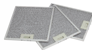
Mesh filter option included