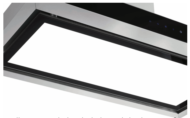
Full LED panel - bright light and shadow proof