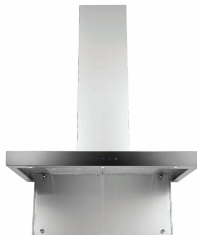
Hinged filter access panel to mesh filters