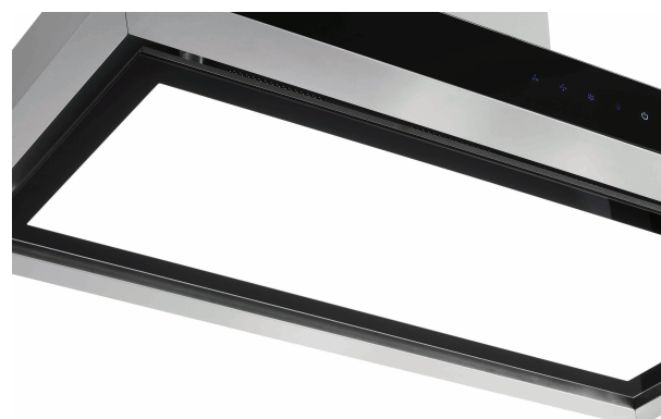
Full LED panel - bright light and shadow proof